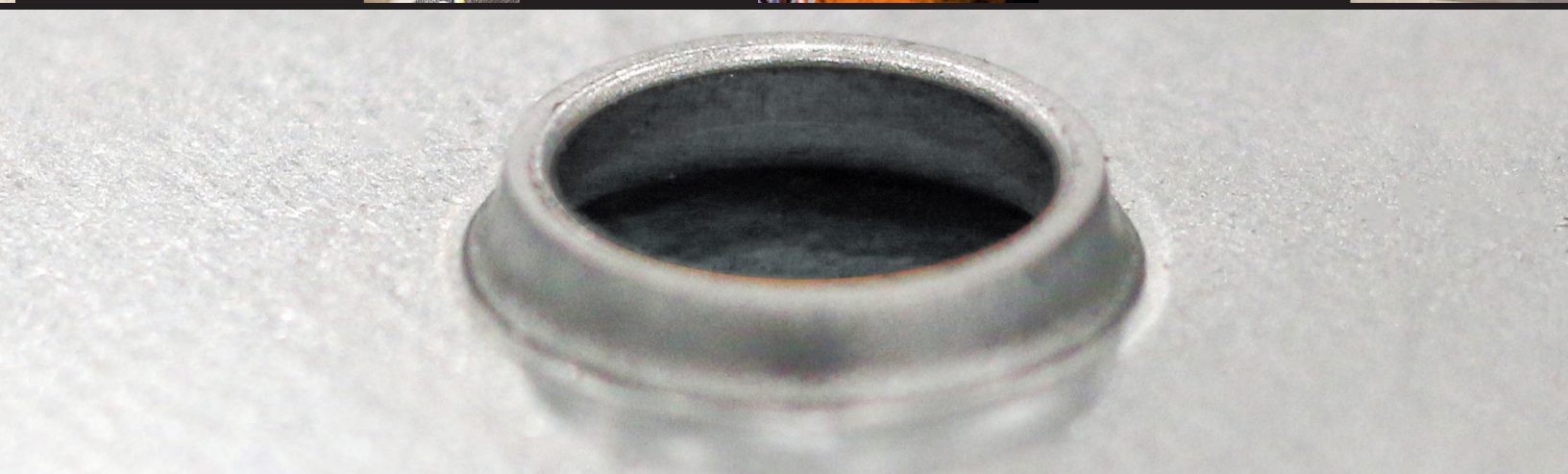
Perfect Extruded Holes For Heat Exchangers