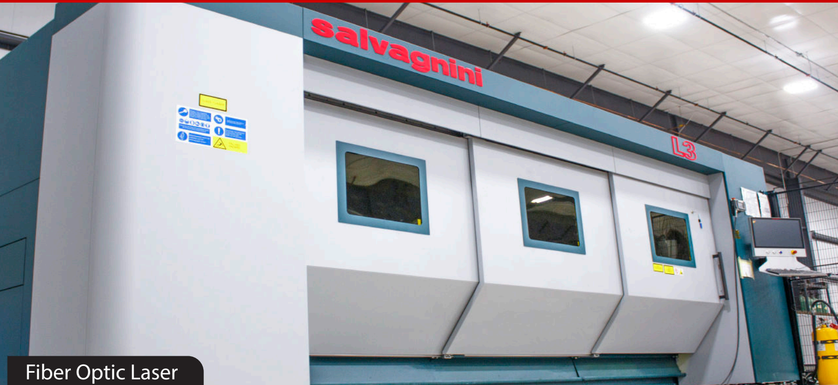
Fiber Optic Laser