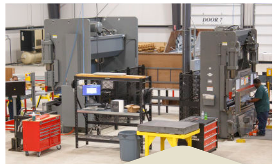
Sheet metal fabrication at the new Ajax plant in Raleigh, North Carolina.

Questions about our Raleigh facility? Call Ajax Sales Engineering at 763-277-7760.