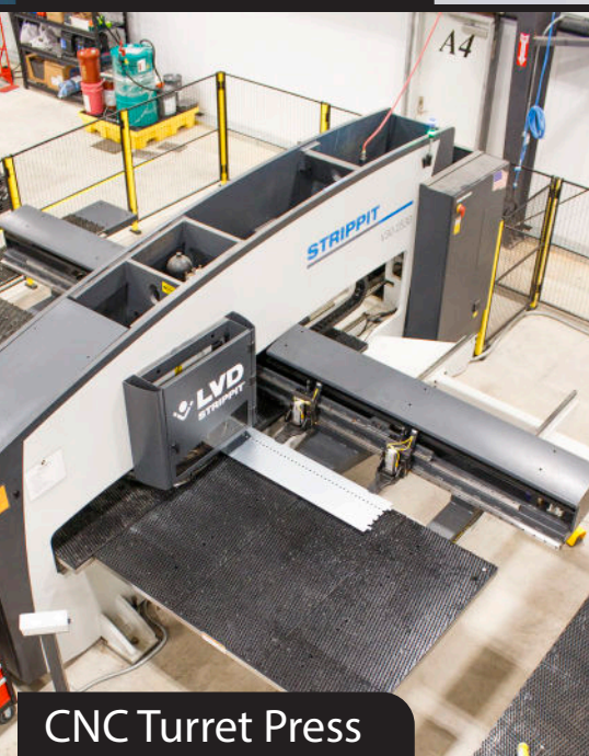
CNC Turret Press